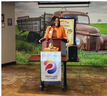
Rotary Club of Camden County