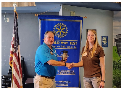
Rotary Club of Camden County, Ga

Let's join in protecting our natural heritage!